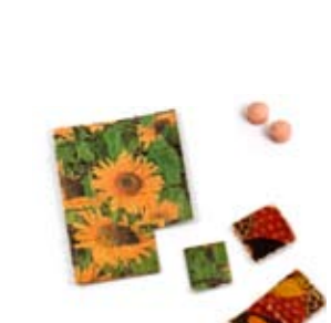
LSD tabs and microdots

Street name: LSD, Acid, Trips, Tabs, Blotters, Microdots, Dots, Magic Mushrooms, 'Shrooms, Mushies