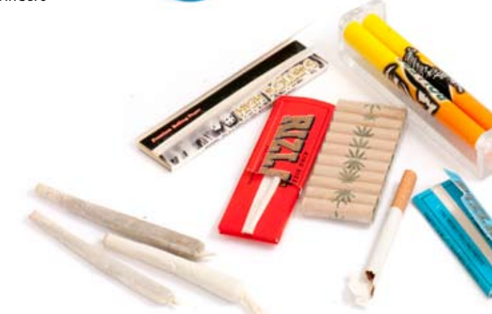
Joints (cannabis) and paraphernalia