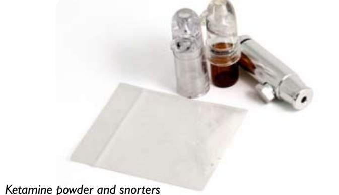
Ketamine powder and snorters

Street name: Special K, Vitamin K, Kitkat, K