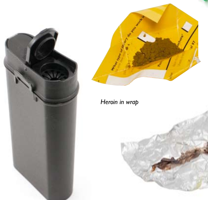
Heroin in wrap

Street name: Heroin, Smack, Brown, Horse, Gear, Junk, H, Jack, Scag, Dragon, Tiger, Powder