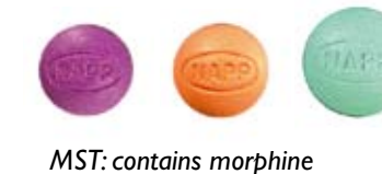
MST: contains morphine