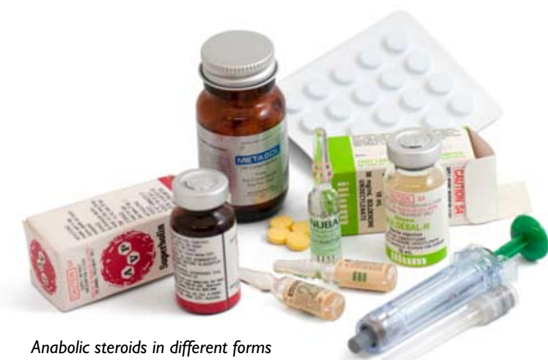
Anabolic steroids in different forms

These are a selection of medicinal preparations which are often abused. Due to the enormous variety only a small selection are shown here. Any prescribed drug should be kept in a locked cupboard. Positive identification of drug type can only be confirmed by analysis.