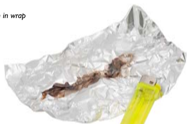
Foil used for smoking heroin