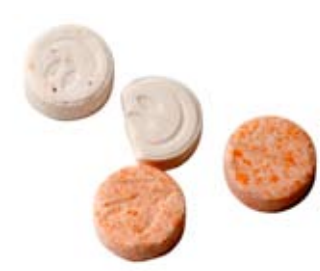
Found in a variety of colours and textures, also in tablet and capsule form

Street name: Speed, Whizz, Uppers, Sulph