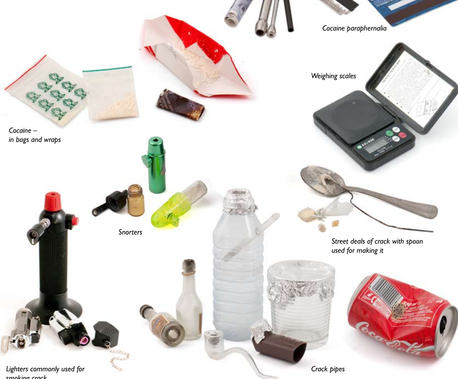
Cocaine – in bags and wraps

Street name: Cocaine, Coke, Charlie, Snow, C, Crack (a smokeable form of cocaine), Rock Wash, Stone