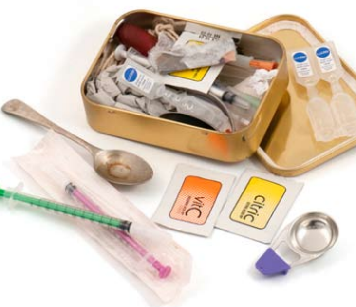
Heroin injecting paraphernalia