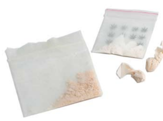
Amphetamine powder in typical street packaging