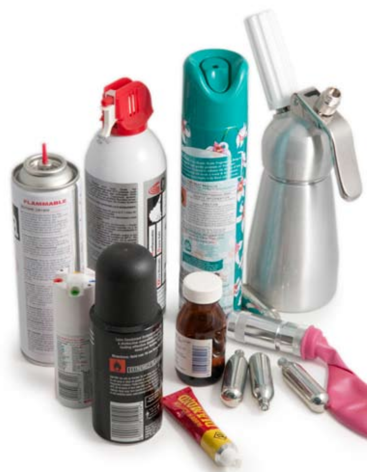
Examples of aerosols, glue, nitrous oxide capsules and 'crackers'

Volatile substances are usually sniffed or inhaled, but gas products are sometimes squirted directly into the mouth. They can cause nausea, vomiting, black-outs and can lead to heart problems resulting in sudden death. There is a risk of suffocation when a plastic bag is used for inhaling gasses or vapours.