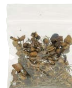
Magic mushrooms (dried)