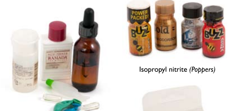
Isopropyl nitrite (Poppers)