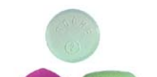
Rohypnol: contains flunitrazepam