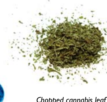
Chopped cannabis leaf