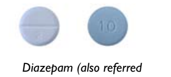
Diazepam (also referred to as valium)