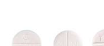
Temazepam (also referred to as normison)