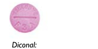
Diconal: contains dipipanone (A)