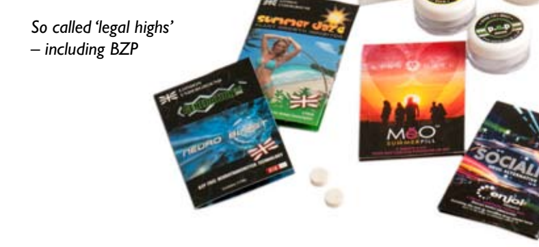
So called 'legal highs' – including BZP