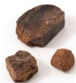
Cannabis resin blocks (hash)