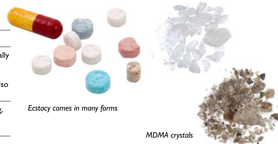
Ecstasy comes in many forms

Street name: E, Doves, XTC, Disco Biscuits, Echoes, Hug Drug, Burgers, Fantasy. Chemical name: MDMA (currently many tablets contain MDEA, MDA, MBDB)