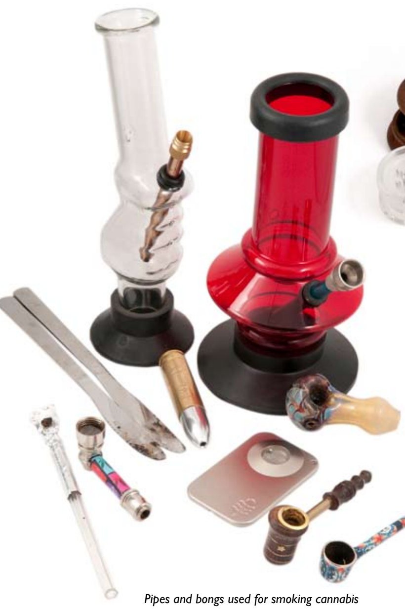
Pipes and bongs used for smoking cannabis